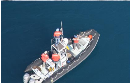
On 21 February 2013, female #1334 was sighted and darted, along with her ninth calf. She is the most prolific mother in the population and apparently uses poorly known habitats.